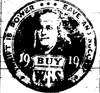
(The picture of Benjamin Franklin reproduced above appears on the War Savings Stamps of the new series.)

OFFICIAL TRADE MARK OF THE 1919 WAR SAVINGS STAMPS